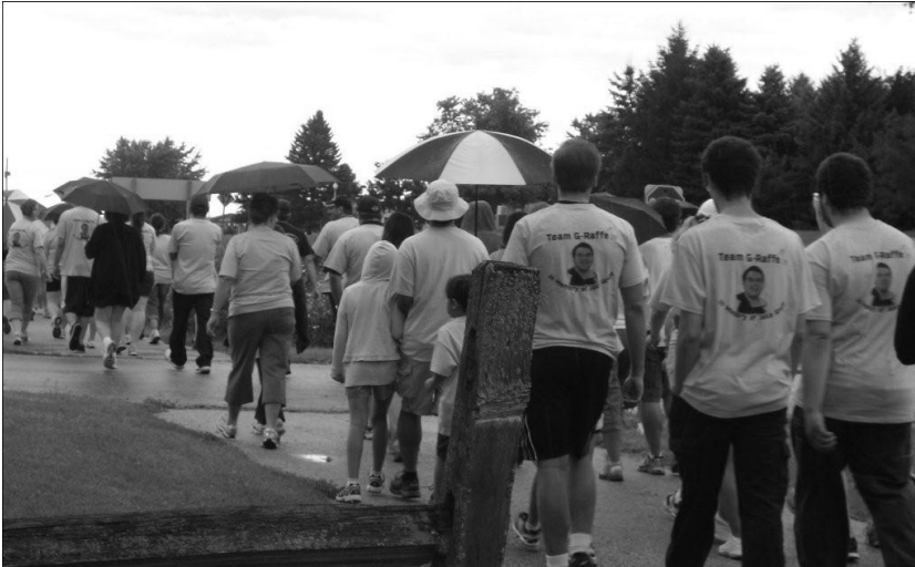
Participants in the 6th annual There is Hope walk head down the Old Plank Road Trail in Sheboygan Falls following the opening ceremony. Additional photos from the event can be viewed at www.mhasheboygan.org .

The proceeds from the event will support MHA's mission of promoting good mental health for people of all ages in Sheboygan County.